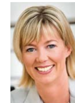
Doris Ahnen, Minister for Education, Science, Youth and Culture

In addition to the evaluation of individual schools, AQS also produces composite summary analyses which provide the basis for political decision-making.